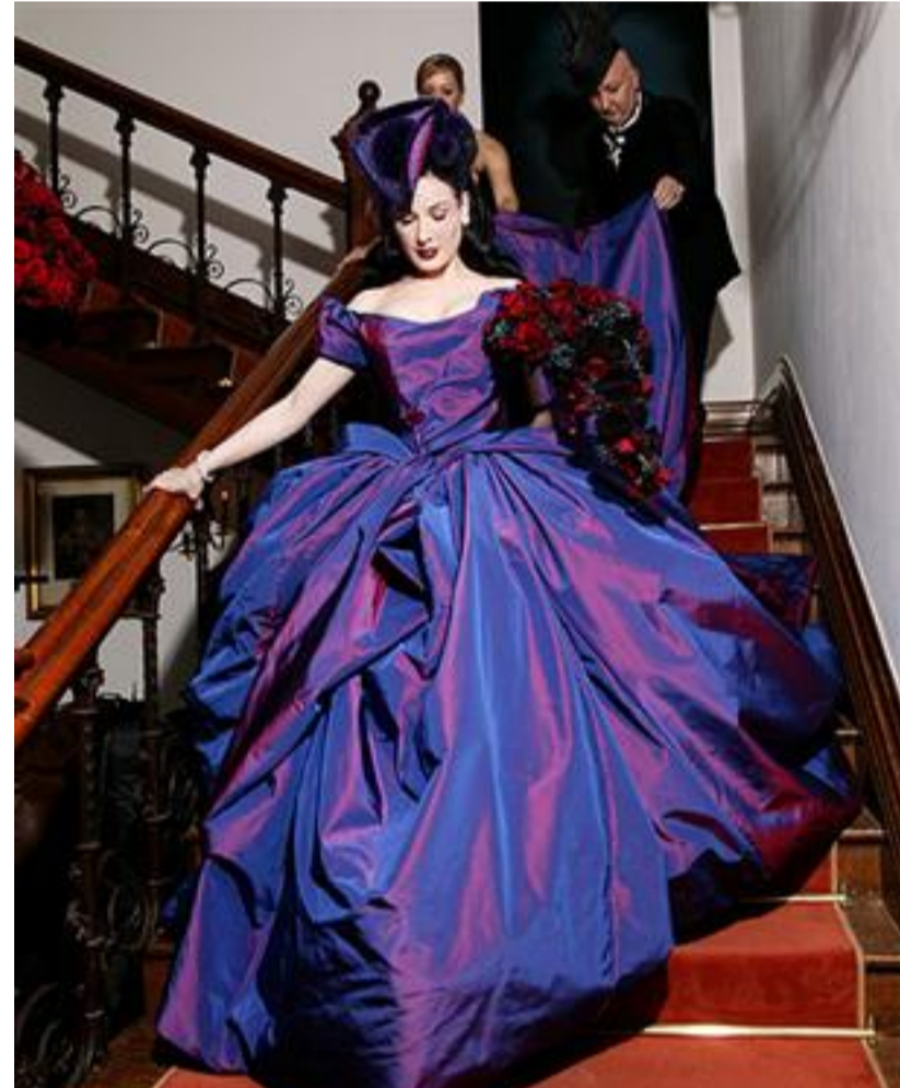
Image: It's not all white - British designer Vivienne Westwood's colourful gown designed for burlesque star Dita Von Teese's marriage to Marilyn Manson will be on display.

WIN! Bendigo Art Gallery and LMFF are offering 10 double tickets to the VIP opening of the White Wedding Dress exhibition this Saturday 30 July. Email your name and phone number to fashion@lmff.com.au - the first ten will win!