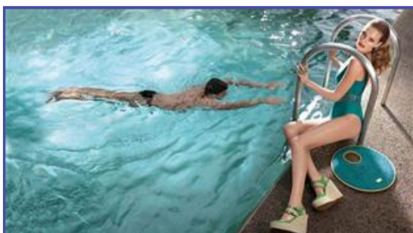
Image: Summer is coming so get ready with some new summer shoes from Nine West.

Daylight saving starts this weekend (in Vic, NSW, ACT & Tas) which we think is a perfect reason to re-evaluate your summer shoe wardrobe. As the days get longer, embrace candy coloured hues and easy styling with chunky wedge espadrilles and breathe new life into your summer wardrobe. Psst... this weekend get 20% off at Nine West ! Four days only, Thursday September 29 - Sunday October 2, 2011. READ MORE .