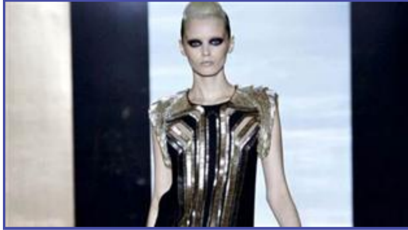
Image: Abbey Lee Kershaw for Gucci at Milan Fashion Week.

It is international fashion week season and while we have been reviewing the many trends it seems we may be looking at a revival of the 1920s in the coming year. At Milan Fashion Week, Gucci sent out slinky, tassel-covered eveningwear and in London, drop waisted flapper inspired dresses took on a modern twist with geometric art deco shapes in the Spijkers en Spijkers show. SEE PICS .